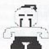
LARMEN MAN Fatal Kung Fu